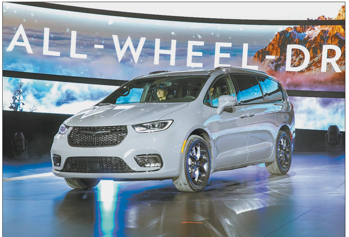
The 2021 Chrysler Pacifica has smart system that gives drivers for the first time a minivan with AWD.

When you can't find the print version of the paper, you can get it online. As an alternative, the TechCenterNews.com address also works.