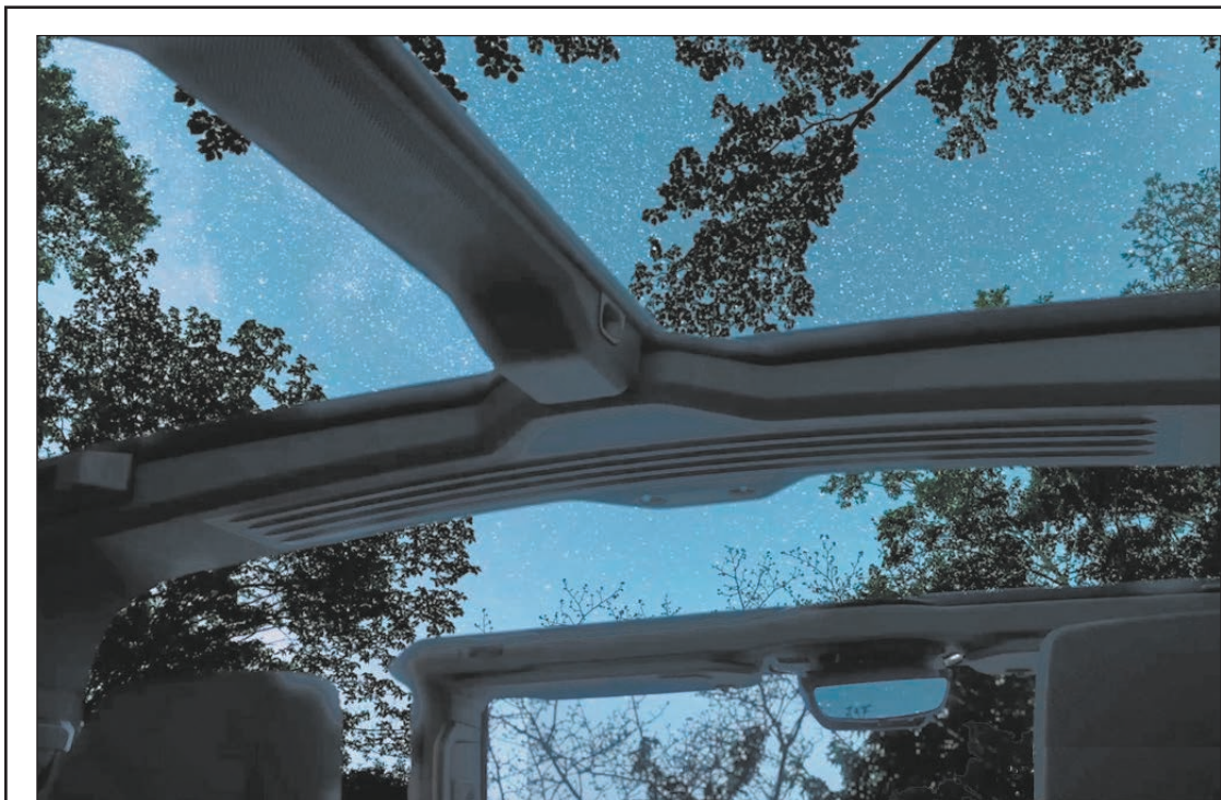
While the COVID-19 crisis has delayed GMC's unveiling of the electric Hummer, the brand has released photos showing its open-air design to eager fans awaiting a good look at the vehicle.