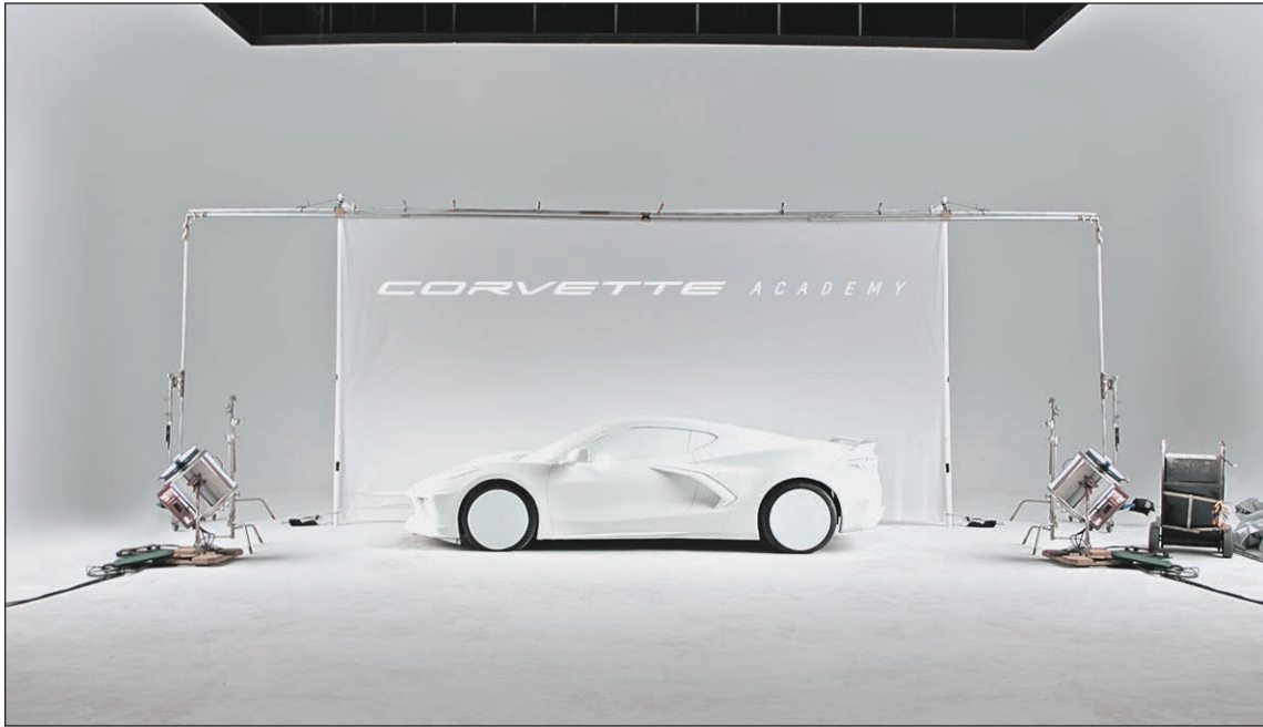
Chevrolet's Corvette Academy, the online learning center for the first mid-engine Corvette, has added 23 new videos to show owners how to get the most out of their cars.