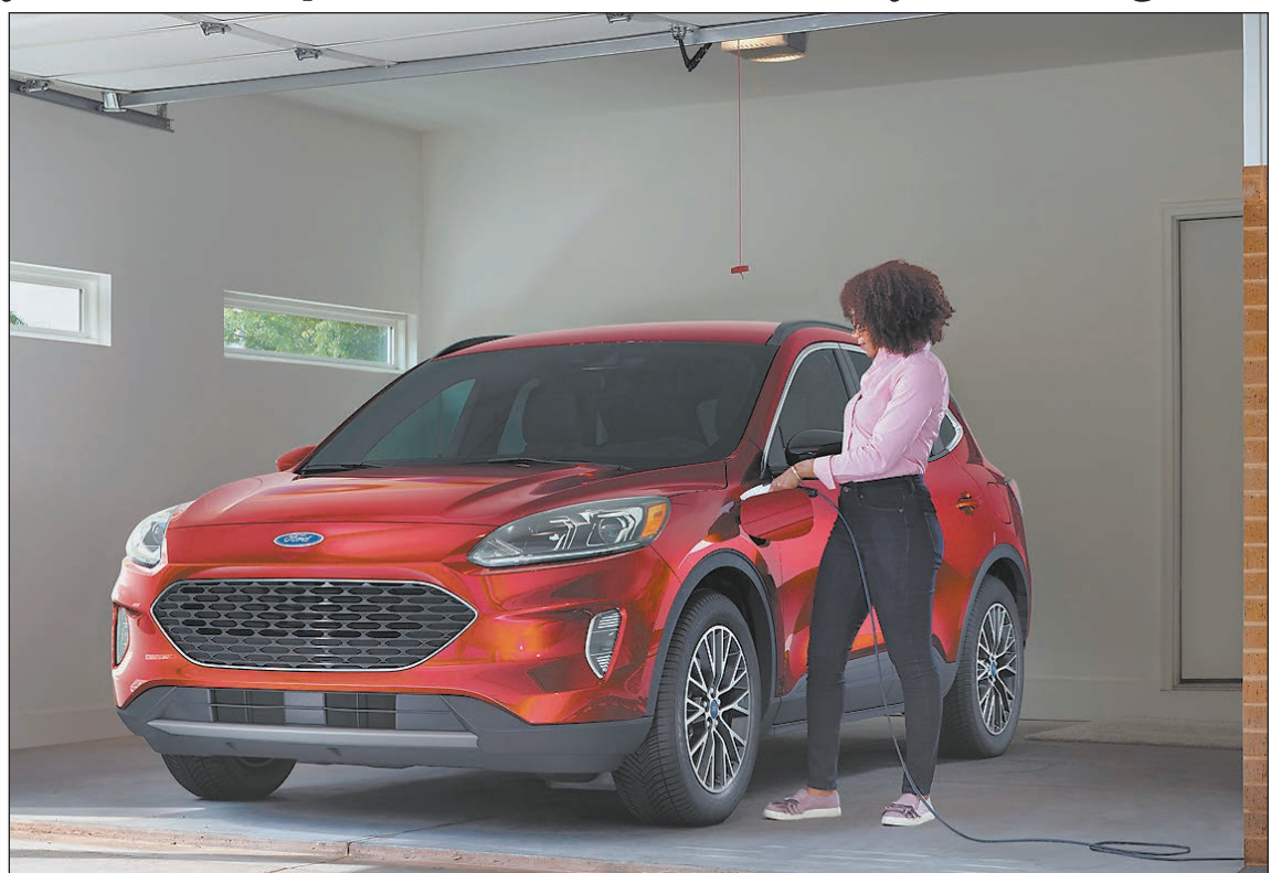
The 2020 Ford Escape Plug-In Hybrid takes care of range anxiety by offering 37 miles of pure EV driving.

Hybrids can serve as a hedge against rising gas prices. The Escape Plug-In Hybrid is available as gas prices are expected to rise, according to AAA, following the easing of stay-at-home mandates across the country. As consumers begin returning to work and taking weekend trips, demand for gasoline is expected to spike from the decades-low prices of the past two months.