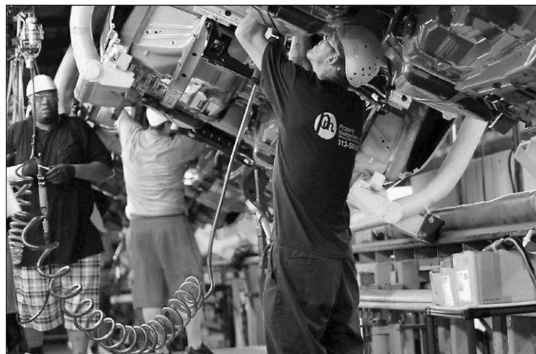
Flat Rock will soon be home to more than a Ford assembly plant.