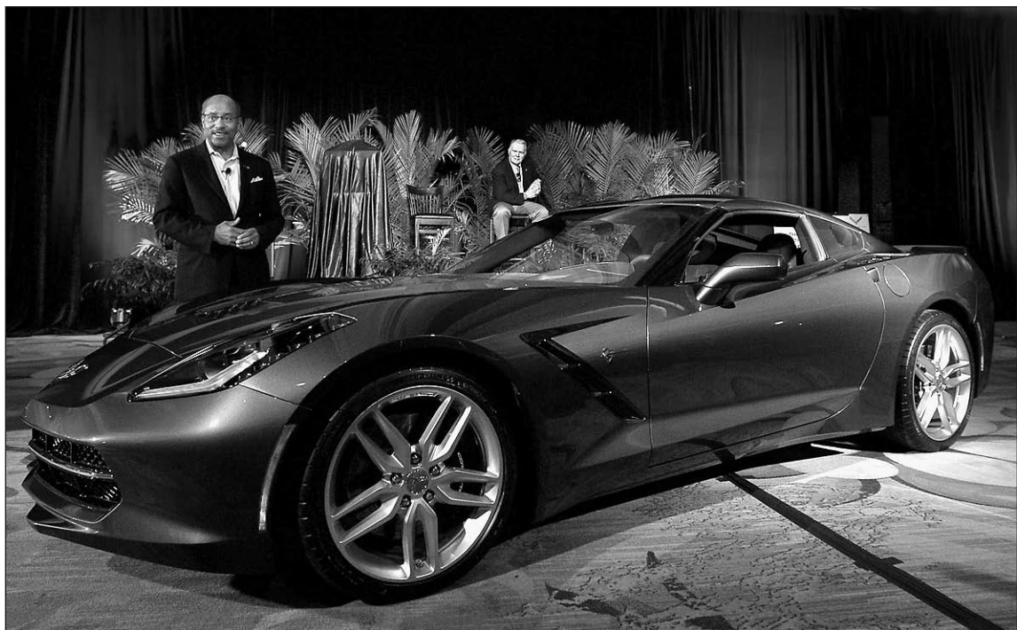
Automotive Hall of Famer Edward Welburn with the 2014 Corvette Stingray.

Volkswagen has admitted to programming its diesel engines to activate pollution controls during government treadmill tests and turning them off for roadway driving.