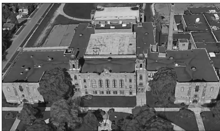
The old Cooley High building could be home to a military academy.

The 2017 Automotive Hall of Fame Induction & Awards Gala Ceremony will take place at 6:00 p.m. on Thursday, July 20, at Cobo Center in Detroit, Michigan. Tickets for the black-tie event are available at www.automotivehalloffame.org .