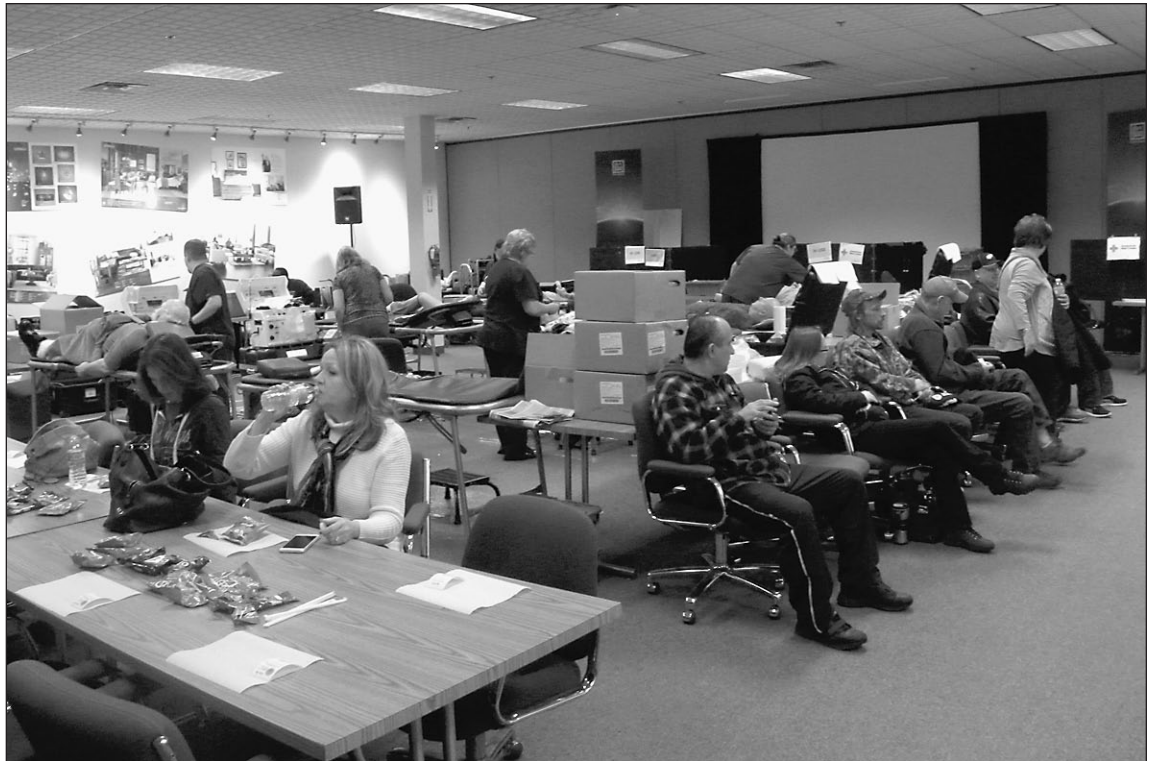
The turnout was appreciated at the Art Van-sponsored Red Cross blood drive Dec. 28.