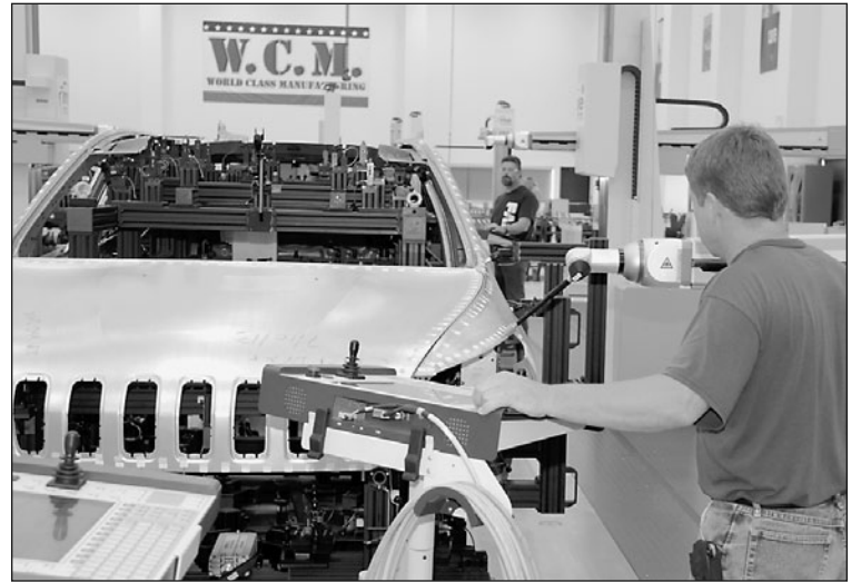
2015 Jeep Cherokee being made at Toledo Assembly