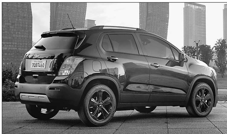
2016 Midnight Edition of the Chevrolet Trax