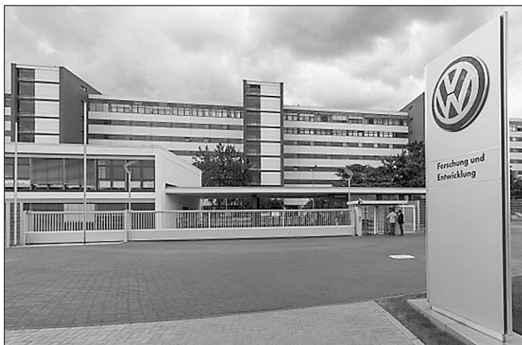
Volkswagen's defeat devices were developed at this facility.

Ford earned $2.7 billion in North America, up 89 percent