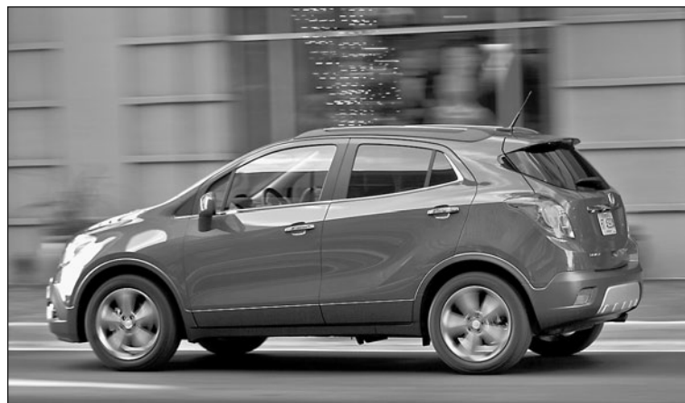
2015 Buick Encore