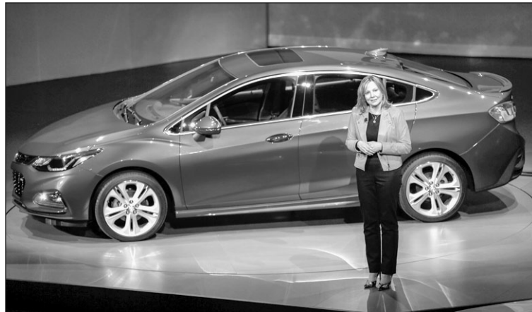
Mary Barra at the 2016 Chevy Cruze reveal in June