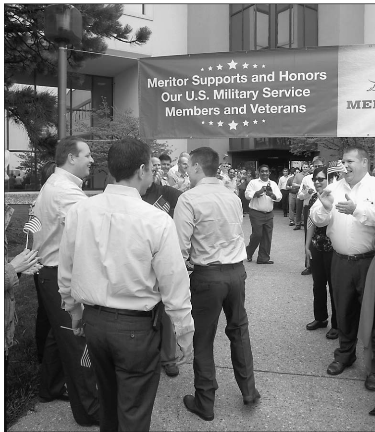
Meritor employees welcome back from Afghanistan, a colleague.