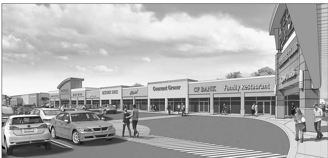
Once the upgrades are completed, the shopping center should look like this rendering.

starting late this year or early next year.