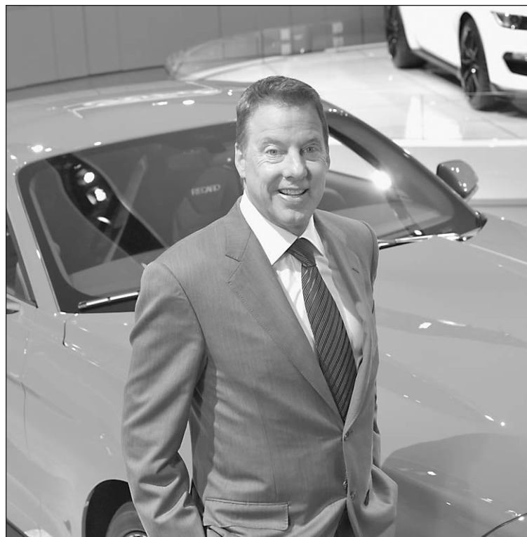
Bill Ford will be thanked by Steven Spielberg this September.