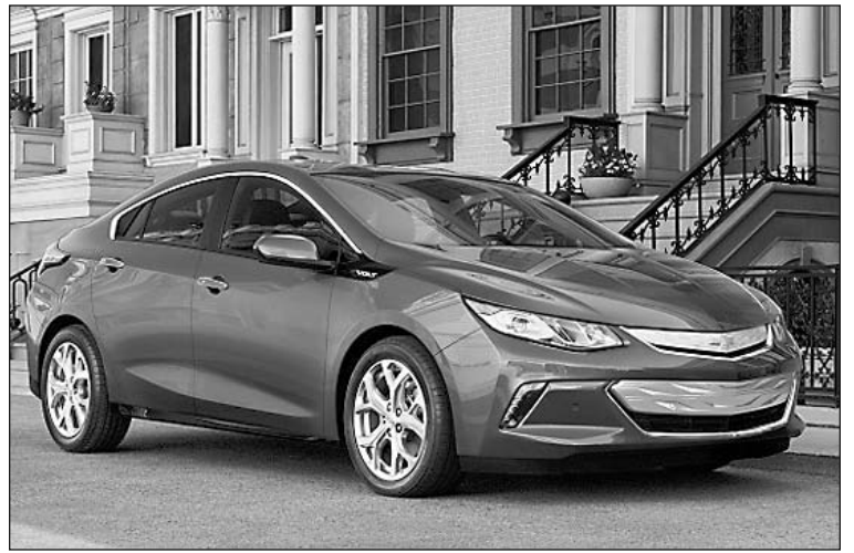
Green vehicles like this 2016 Volt will play a greater role in GM's future.

• Becoming a founding member of the Business Renewables Center that aims to double U.S.