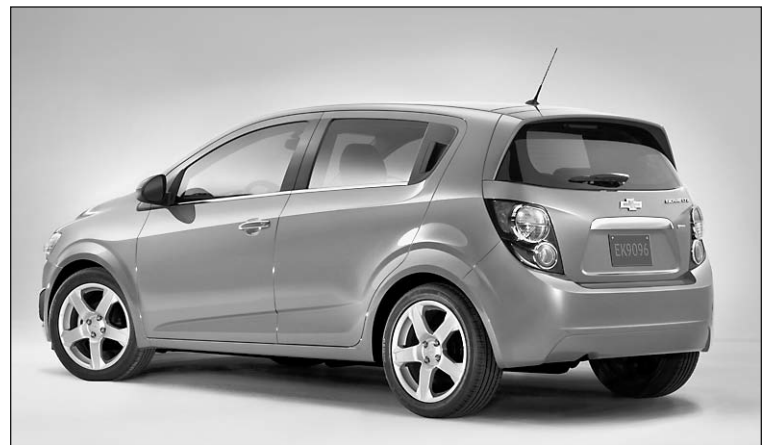
2015 Chevrolet Sonic

"With good ratings across the board in all five IIHS crashworthiness evaluations, the improved