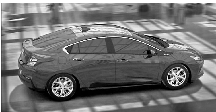
2016 Chevrolet Volt

The new Volt is an electric car with extended range, showcasing a sleeker, sportier design that offers 50 miles of EV range, greater efficiency and stronger acceleration, Vazquez said. The Volt's new, efficient propulsion system will offer an estimated total driving range of more than 400 miles. With regular charging, owners can expect to average more than 1,000 miles between gas fill-ups.