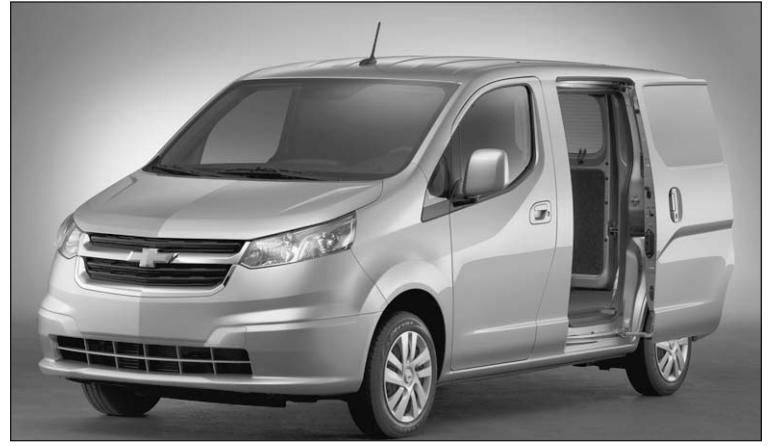
2015 City Express