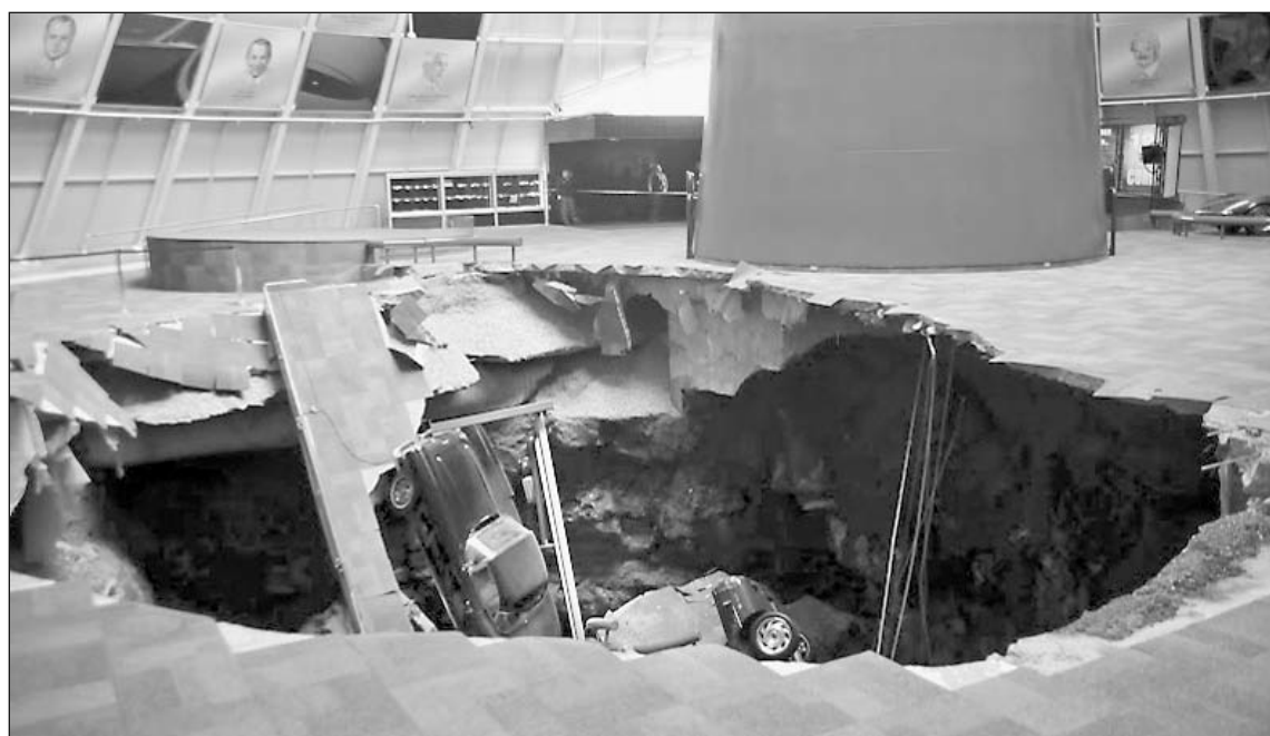
Eight Corvettes - two from GM Heritage Center - fell 30 feet when a sinkhole opened at the Corvette Museum.