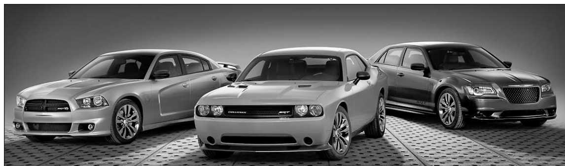
2014 models of, from left, Dodge Charger, Dodge Challenger, Chrysler 300