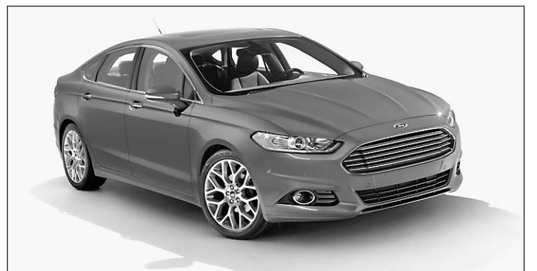
2013 Ford Fusion

GM's new CEO was good news because of her broad experience in different departments at GM.