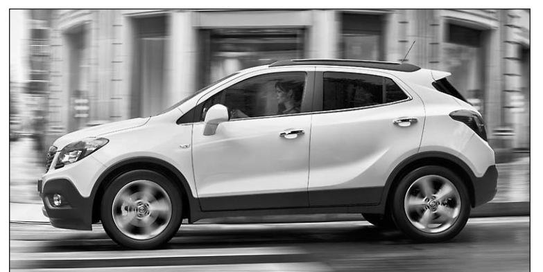
The Opel Mokka, based on GM's Gamma II platform