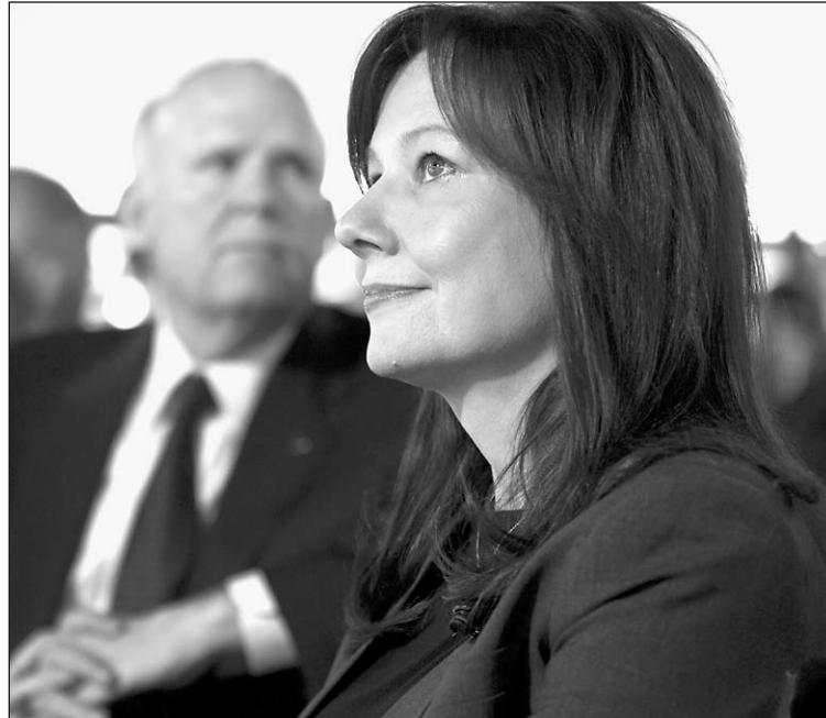
Mary Barra, foreground, and Dan Akerson