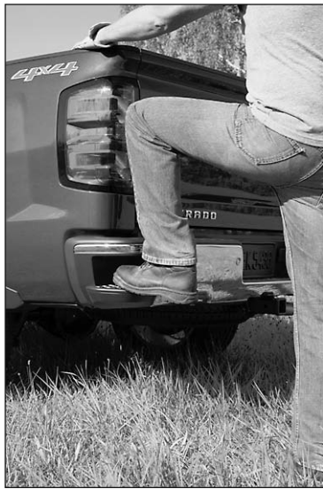
The cornerstep feature makes the 2014 Silverado more user-friendly.

For example, when Chevy designers put the cornerstep on the Avalanche, the truck people thought that innovation was a