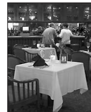
This table is for you.

Filet, Sirloin, Chateaubriand, Medallions, Porterhouse, Veal & Lamb Chops