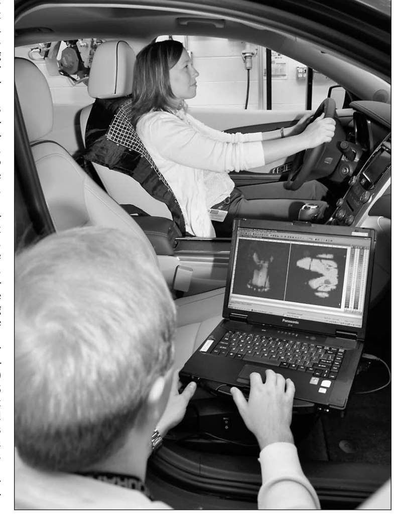
CONTINUED ON PAGE 2 GM seat engineers use high-tech equipment for the Chevrolet Impala.

Seat testers typically drive or ride in prototype vehicles for