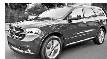
2013 Dodge Durango