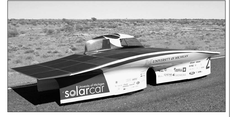
U-M's solar car Generation in Australia

Hausman said. A dependable car means less race time spent on the side of the road. In 2011, the team had to stop twice in one day to repair torn wheel fairings while the first- and second-place teams pulled ahead.