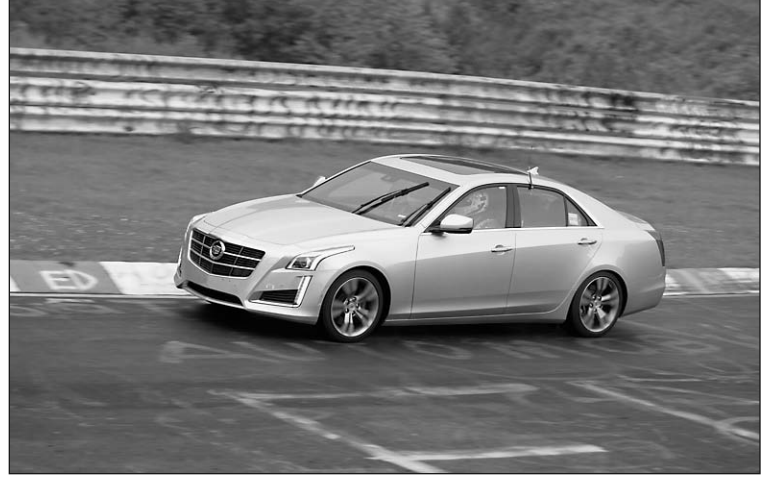
2014 Cadillac CTS speeds around the track at Nürburgring.

Cadillac vehicle dynamics performance engineers Kevin Zelenka and Jeff Grabowski drove full production models of CTS and CTS Vsport with no performance modifications, which they say validates the new 2014 CTS