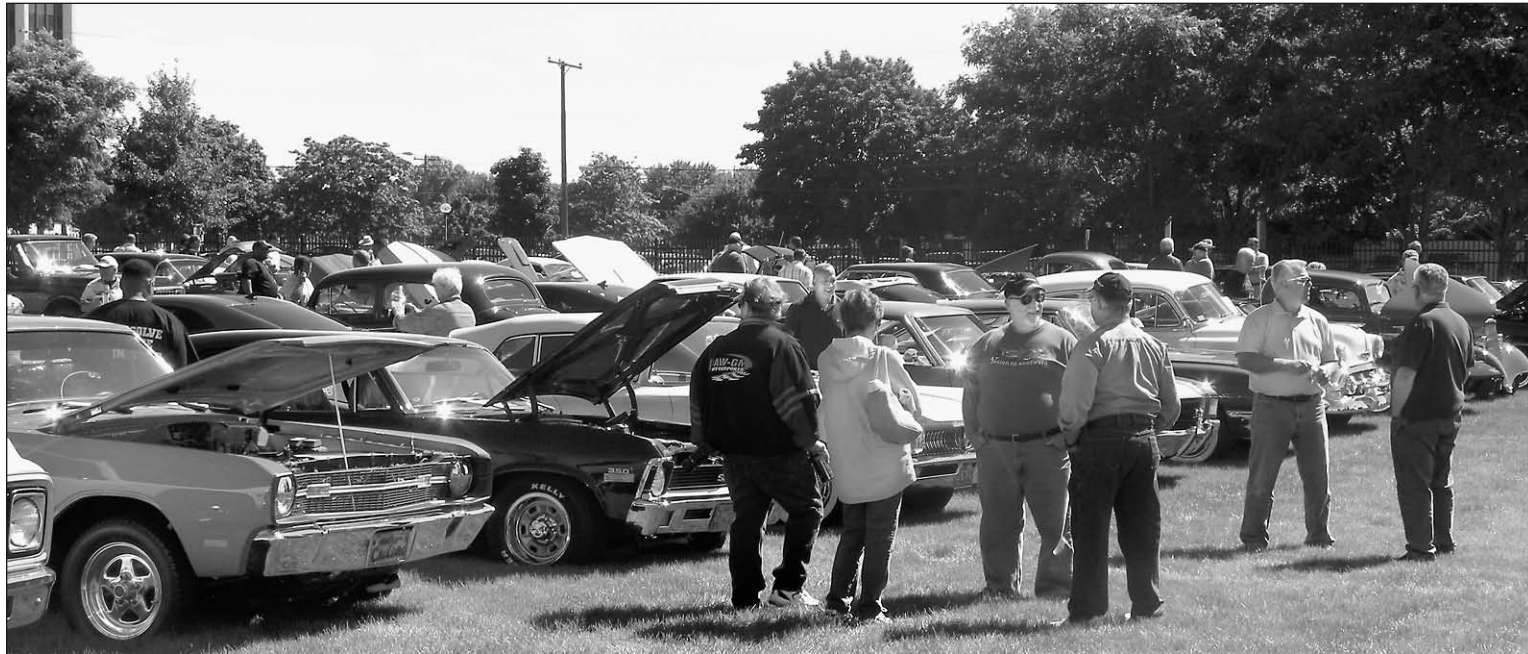
Crowds of classic car aficionados spent time looking, lingering and kibitzing at this year's GM Tech Center Employee Car Show in Warren.