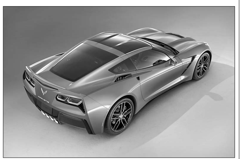
2014 Corvette Stingray

SPECIAL NOTE: Drag racing, street and custom cars now have national certification of their significant contribution to the history of the progress of American cars.