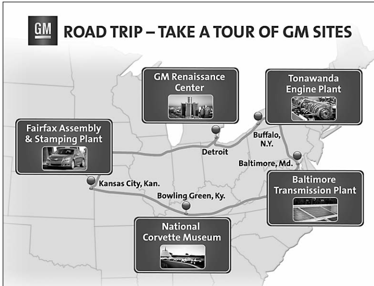
Here are a few of the visitor-friendly GM plants and related facilities from the East Coast to west of the Mississippi River.

On the east side of the Mississippi is the "other" Kansas City