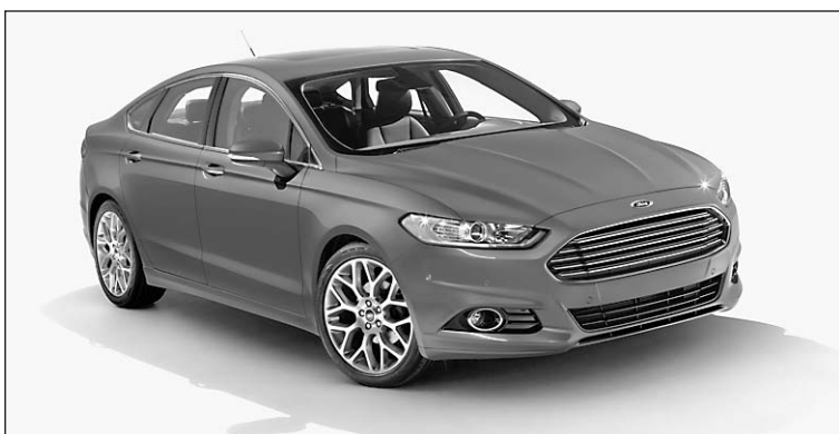
2013 Ford Fusion