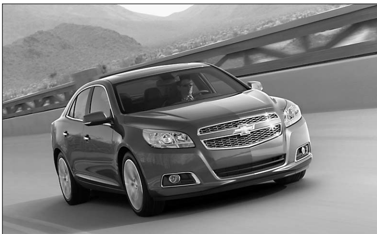
2013 Chevy Malibu