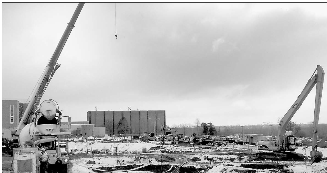
Construction of Oakland University's Engineering Center is underway.

Netlink's commitment to serve Detroit and surrounding communities through their support of various not-for-profit organizations, such as VIP Mentoring and Netlink Foundation a children's rights organization, make them the award winner of the first ever Lear supplier "Community Service" award.