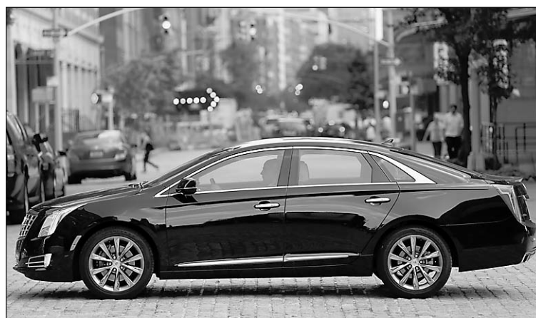
The XTS W20 livery package aims to get bigger sales in the livery segment.