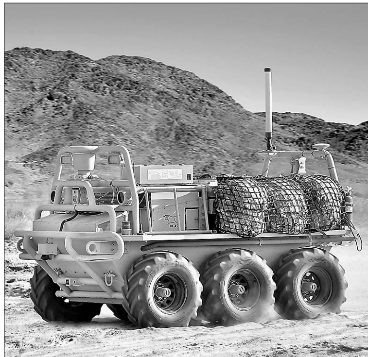
An operator at TARDEC test drove this semi-autonomous Army vehicle.