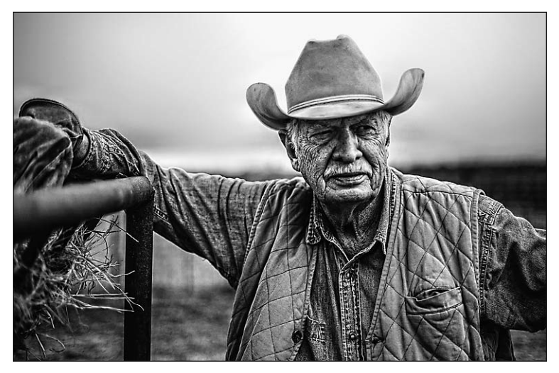
This photo used in Ram's "Farmer" Super Bowl ad was just one of many commissioned by Chrysler during the production of the commercial.