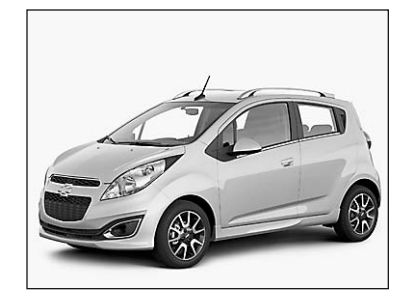
2013 Chevrolet Spark

Data shows that 23 percent of Spark owners are choosing Salsa Red, making it the Spark's most popular exterior color. Jalapeno Green and Denim Blue are the second- and third-most-popular Spark colors.