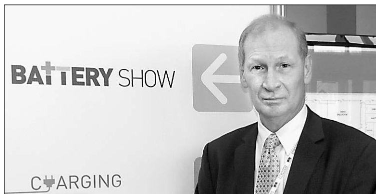
Galyen talks EVs at the recent Battery Show in Novi.