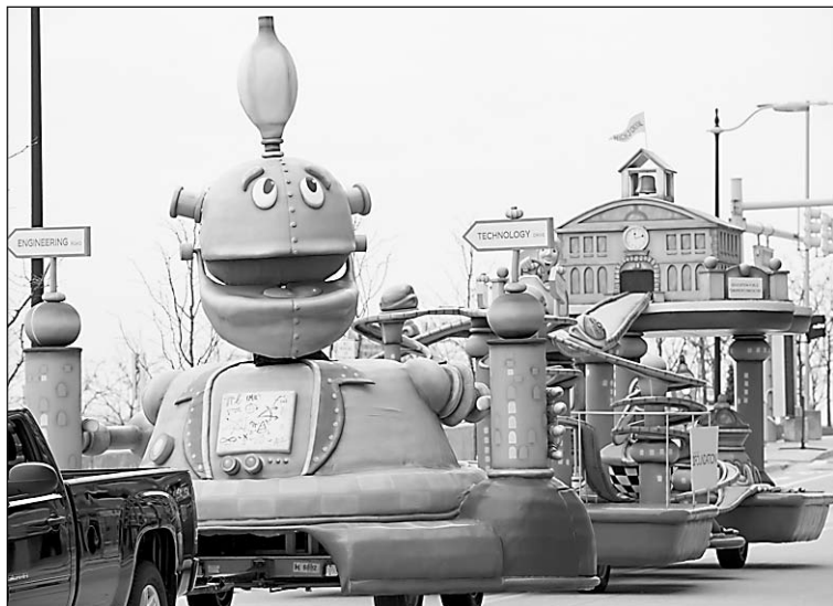
The GM Foundation-sponsored float for Detroit's Thanksgiving Day Parade is being designed and built by The Parade Company.