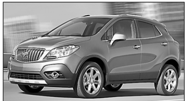
2013 Buick Encore

Fuel economy estimates for Encore models with all-wheel drive will be announced later.