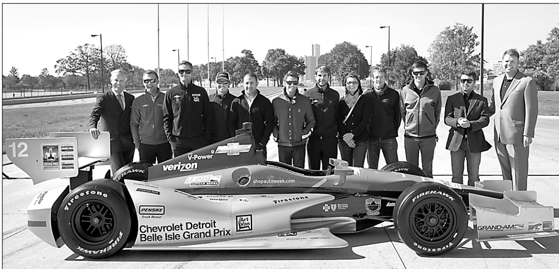
Drivers and organizers all look forward to next year's "doubleheader" on an expanded Belle Isle track.

Do not ever bet against Schumacher at Indy!!! Schumacher beat Massey off the line and made a quicker run to tie Bob Glidden with nine U.S. Nationals wins. There were several flashes atop his engine, but the track is clean and his car showed no visible damage.