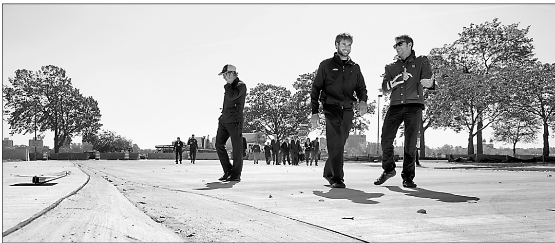
Drivers inspecting the fixing of the track.