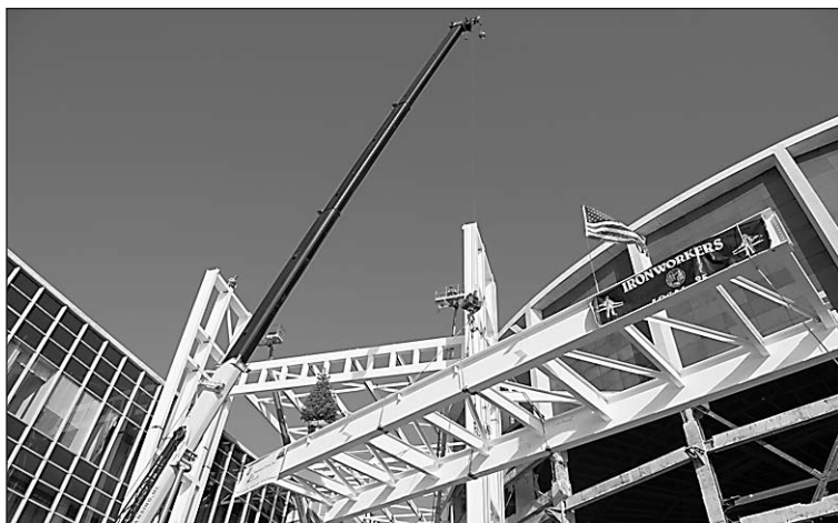
Cobo Center is getting a new glass atrium.

90 feet high, will create a level rooftop between the facility and new ballroom space.