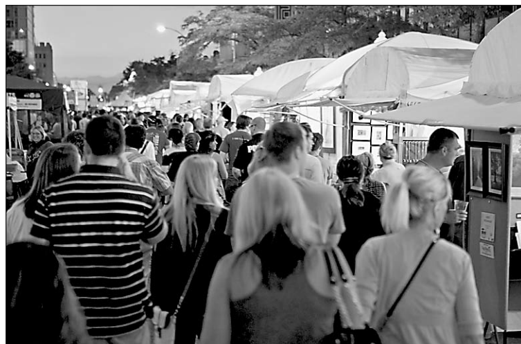
Arts, Beats, Labor Day weekend.