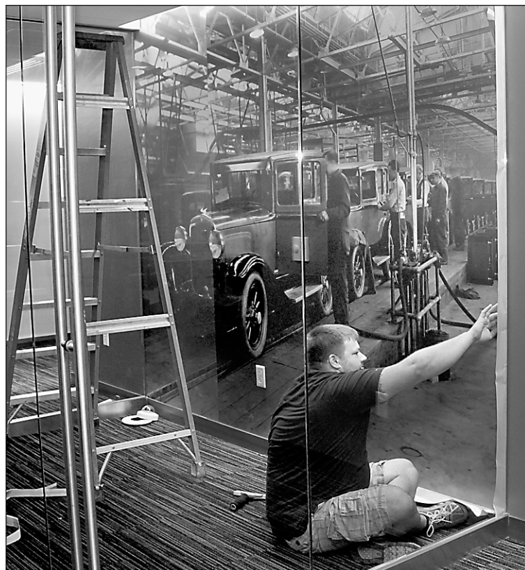
A worker installs a mural featuring vintage Chrysler photography.

Meanwhile, back in late April, when the project was first announced, Chrysler CEO Sergio Marchionne said, "The future of Chrysler group and the city of Detroit are inextricably tied. In order to reflect this, we want to go beyond spiritual or symbolic evidence of our faith in the city's