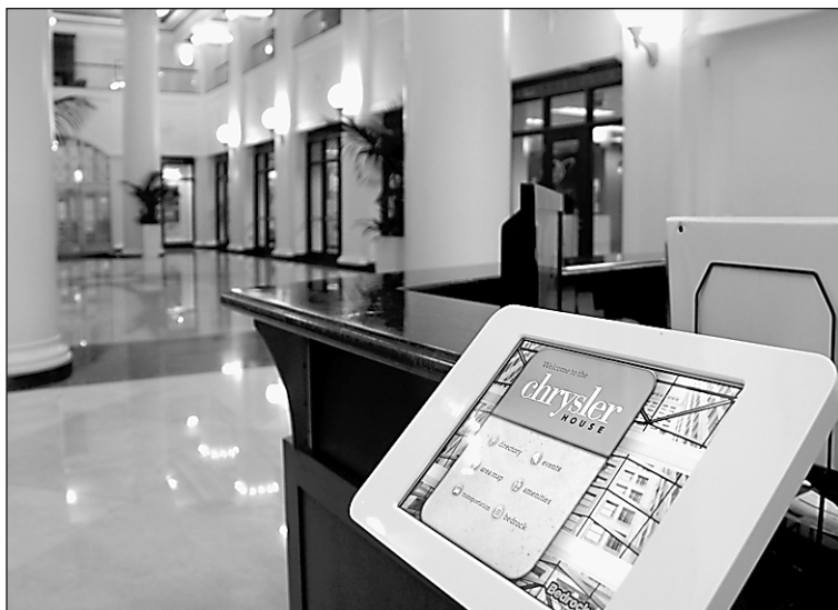
Lobby of the Chrysler House, formerly known as the Dime Building.

room, a state-of-the-art board room and a kitchen.