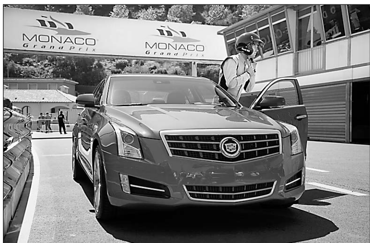
ATS in Monaco.

In Patagonia, famed as the windiest place on earth, the ATS' advanced dynamics were put to the test. In Morocco, Hill pilots the ATS through a treacherous mountain road in the Atlas Mountains that features 100 corners. In Monaco, ATS attacks the legendary Monaco Grand Prix circuit. You get the idea.