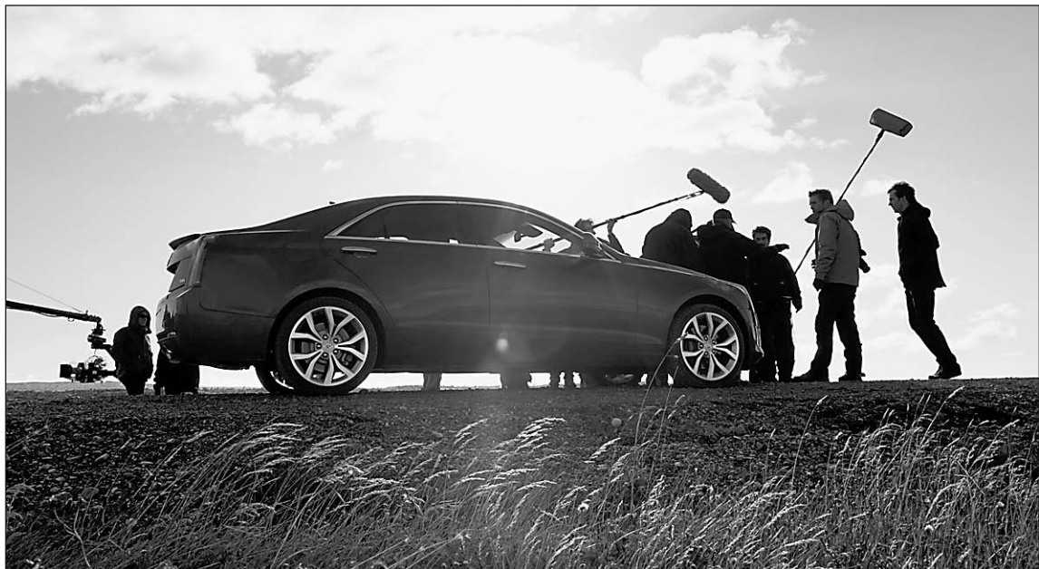
ATS vs. the World film crew prepares to test the ATS in Patagonia, Chile, so it will buzz on the internet.