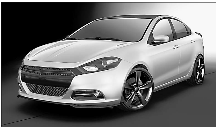
2013 Dart Customized by Rap Star Pitbull