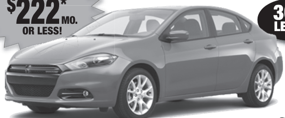
ALL-NEW DODGE DART