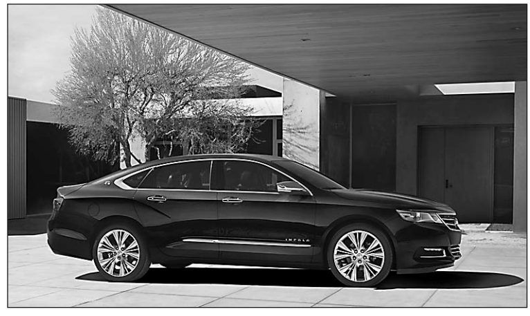
2014 Chevrolet Impala

family of four-cylinder engines developed with increased efficiency and greater refinement. Output is estimated at 195 horsepower (145 kW).