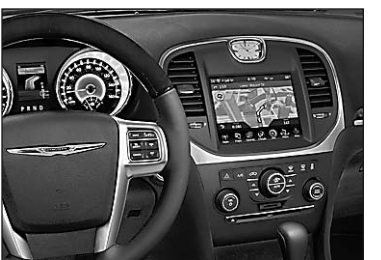
New Garmin navigation system.

• 3D Buildings, Landmarks and Terrain – Realistic 3D views of buildings and key landmarks throughout major U.S. cities provide drivers better orientation. Using topographic map data, the