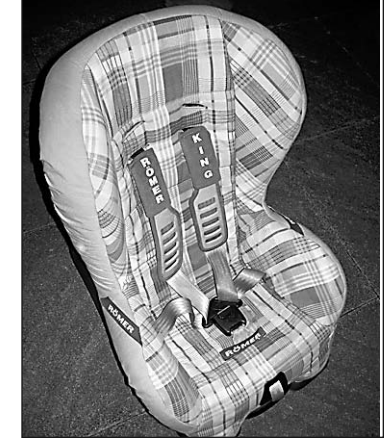
U-M says parents are confused how best to secure their youngsters.

The American Academy of Pediatrics issued new Guidelines for Child Passenger Safety in 2011. They called for rear-facing car seats at least until the age of two; forward-facing car seats with a five-point harness for as long as possible until the child is the maximum weight and height suggested by the manufacturer; booster seats until an adult seat belt fits properly, when a child reaches around 57" in height, the average height of an 11-year-old; and riding in the back seat until the age of 13. "We found that few children remain rear-facing after age 1, fewer than 2% use a booster seat after age 7, many over age six sit in the front seat," says Michelle L. Macy, MD, MS, co-author of the study along with Gary L. Freed, MD, MPH, both of the Child Health Evaluation and Research Unit, Division of General Pediatrics. C.S. Mott Children's Hospital at the University of Michigan, Ann Arbor.