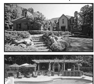
Custom built with 5 bedrooms, 4.2 baths. Over 4,900 sq. ft. $1,390,000

On 3+ Acres 4194 Windmill Farms, Milford