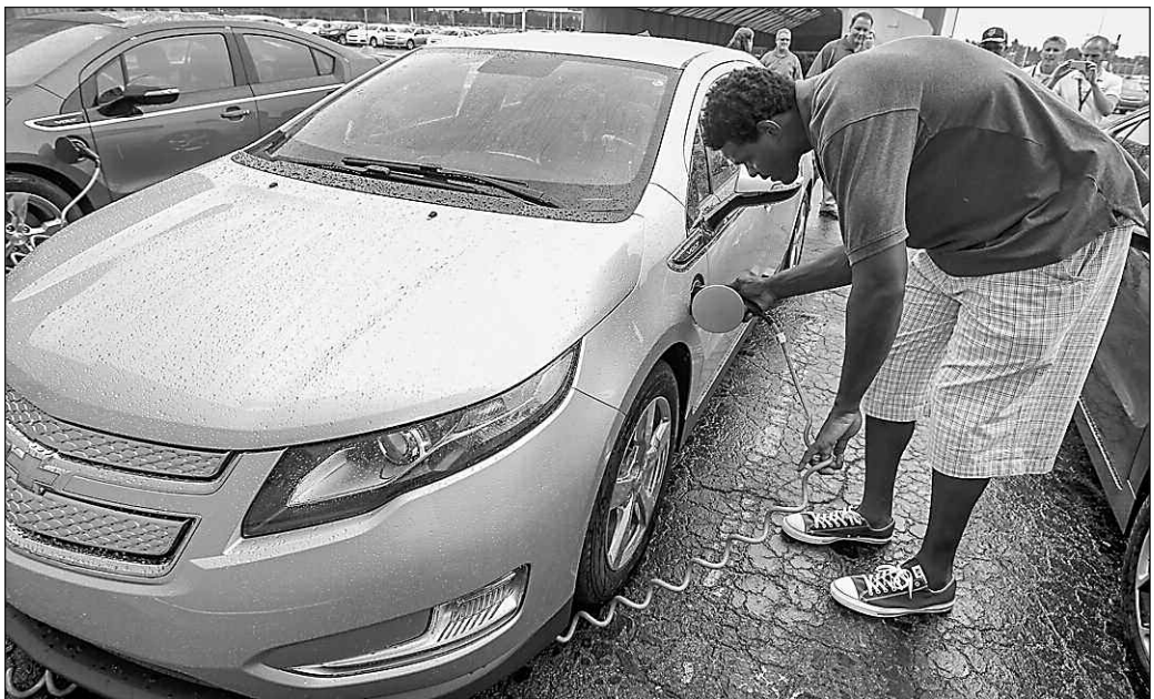
Plugging in a Chevrolet Volt while touring GM's Detroit-Hamtramck Assembly Center.