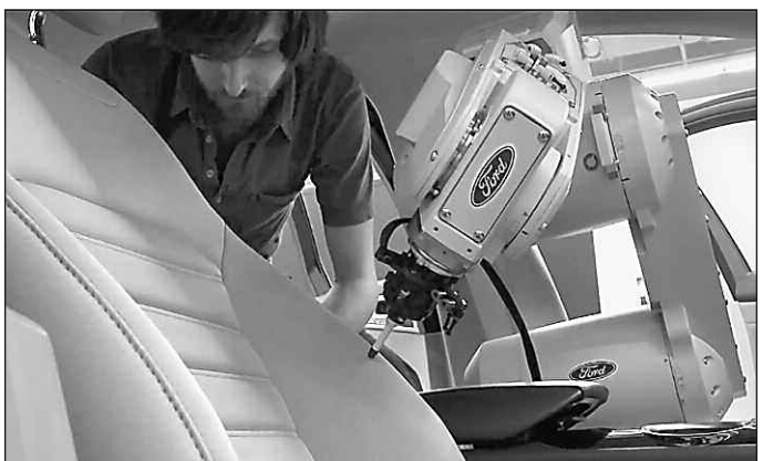
Robotized Unit for Tactility and Haptics (RUTH).