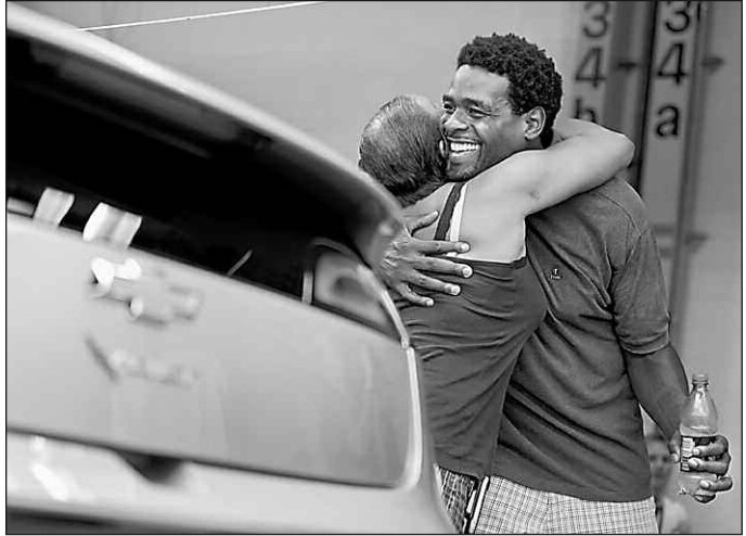
Former NBA player Chris Webber hugs a line worker.

GM assembly line staff have seen a number of celebrities come and go, but they especially enjoyed seeing Webber.