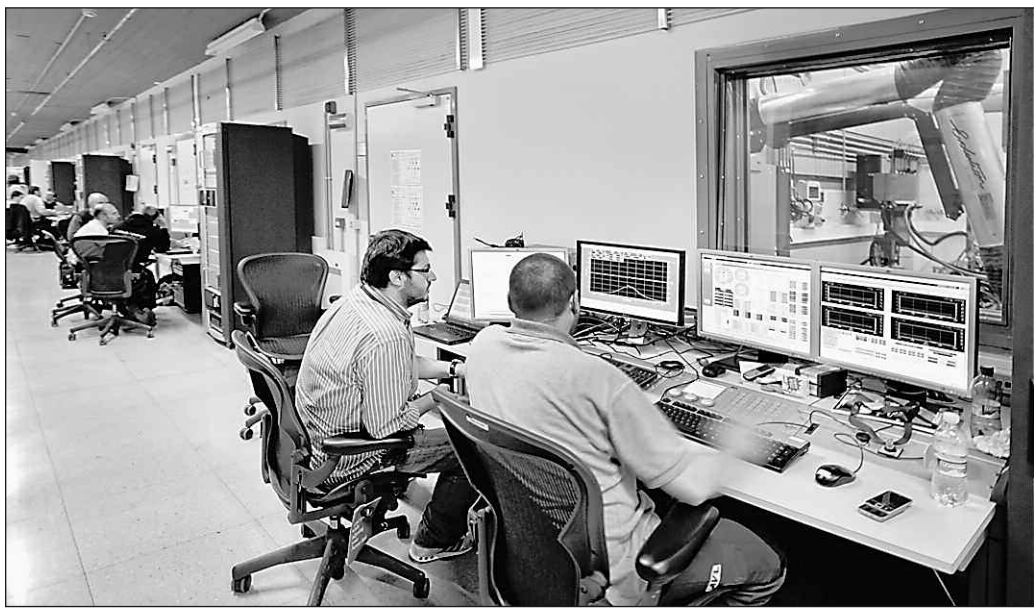
Engineers at GM's Powertrain Engineering Center in Torino, Italy, monitor engine testing.

GM's Pontiac (Mich.) Engineering Center also sends en-