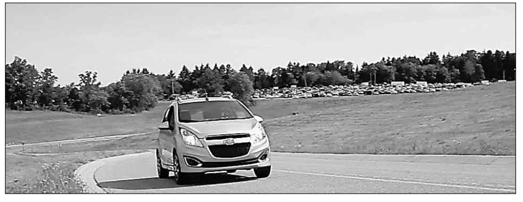
The 2013 Chevrolet Spark comes standard with Hill Start Assist, which helps drivers of manual transmission-equipped vehicles navigate steep inclines or declines in cities known for their hilly terrain. The Spark also features as standard a Panic Brake Assist for emergencies.

• Giving the Spark the ability to conquer steep inclines and declines with Hill Start Assist and equipping the Spark with a sixth sense with Panic Brake Assist - both standard mum braking force.