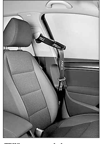
TRW's new seat belt system.

takes the belt, the arm simply tems, braking systems, steer-