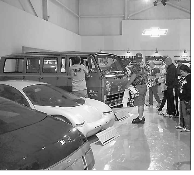
The 2012 Hot Rod Power Tour cruisers check out a lineup of classic GM cars at the GM Heritage Center in Sterling Heights.

ways of the GM Tech Center, ber of car designs during his or at least of GM Design," design chief, the famous Earl. Pasteiner influenced a num-