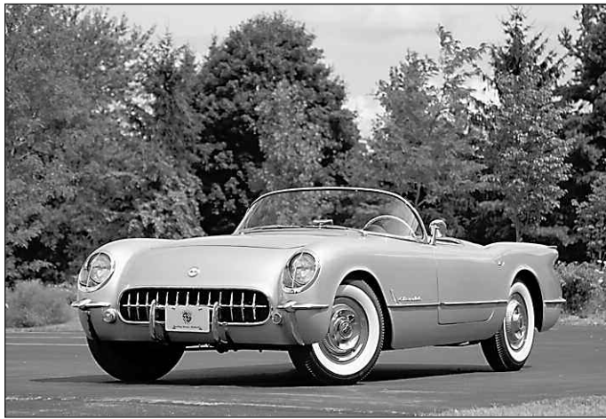
This 1954 Styling Corvette, from the Lingenfelter Collection in Brighton, will be on display at the 2012 EyesOn Design car show at the Edsel Ford House on Father's Day.