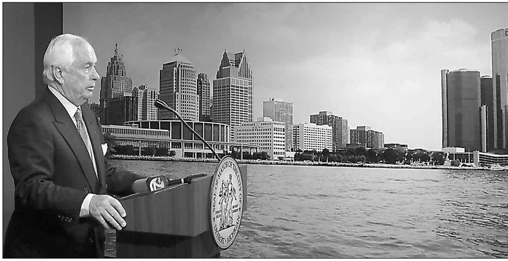
Roger Penske discusses what happened at the Detroit Grand Prix on Belle Isle in a briefing at Detroit city hall last week. In spite of the pavement issues, Penske praised his race management team.

"I'm sorry we had to have a delay (due to warping track) but that happens, there's a rain delay sometimes in baseball, we had a little track de-