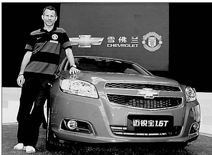
Manchester United superstar Ryan Giggs, the most decorated player in English football history and holder of the club record for competitive appearances, makes an appearance in Shanghai, China, with a Chevrolet Malibu. Chevrolet is entering into a five-year partnership agreement with Barclays Premier League giant Manchester United to become the club's Official Automotive Partner. It's notable for a U.S. marque to support English soccer.

"Like the Club, it is steeped in history, having recently celebrated its centenary, and it has also grown to be a global brand, selling cars in more than 140 countries. Above all, it too strives to be the best in