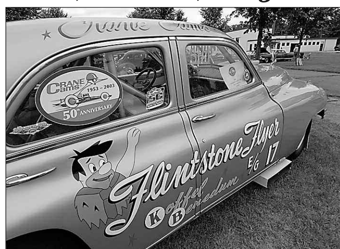
Dave Koffel's 1949 Packard Gasser called the "Flintstone Flyer" will be one of the marquee vehicles at the Cars 'R Stars car show at the old Packard Proving Grounds in Shelby Twp. June 10.

"This show is for the drag fans, the people who want to see and hear these cars up