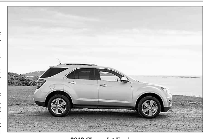
2012 Chevrolet Equinox

It also seems practical as a guessing that Equinox sales