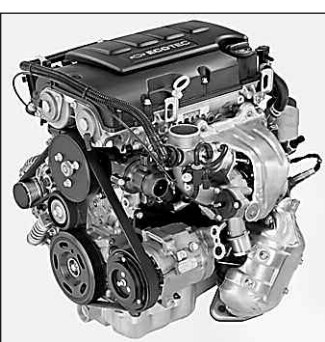
The Ecotec 1.4L four-cylinder engine for Sonic integrates features for both performance and fuel economy. Features include turbocharging with intercooling, variable displacement oil pump, electronically controlled thermostat and continuously variable valve timing for both intake and exhaust valves.