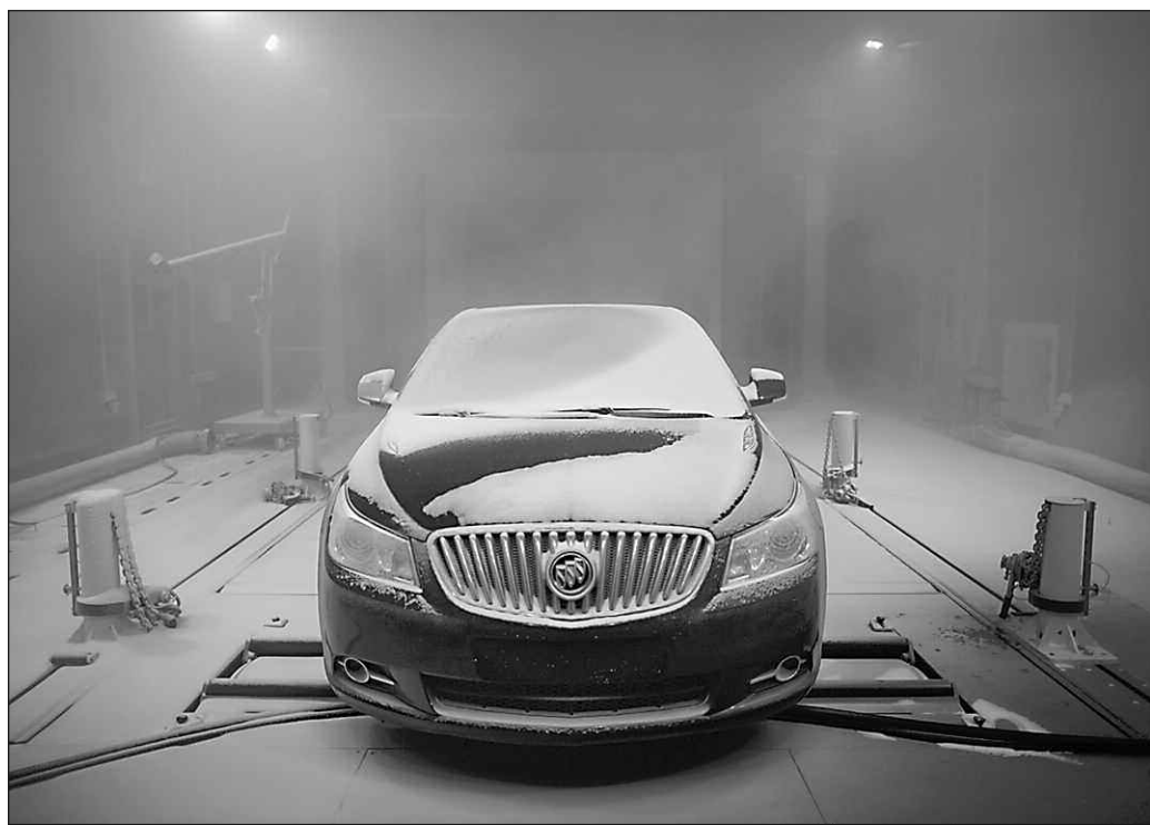
PATAC engineers conduct winter testing on a Buick LaCrosse at the PATAC Climate Wind Tunnel in Shanghai, China.