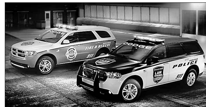
Chrysler said last week that the new 2012 Dodge Durango Special Service model is now available to order for law enforcement and other fleet customers alike.