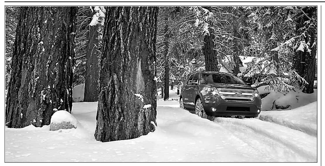
Whether you go over the river or through the snow to Grandma's house, Ford offers a 10 "dos and don'ts" list for safe winter driving. Pictured is the Ford Explorer.