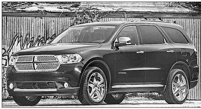
The all-new 2011 Dodge Durango SUV cuts a much sleeker exterior profile than the earlier version of the vehicle. It will be built at Jefferson North assembly plant in Detroit.

"We're delighted that Dodge has chosen our Virginia Beach half marathon to unveil its new Durango, which will lead more than 20,000 runners across the finish line