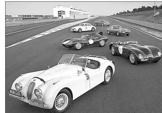
Decades of Jaguar automotive heritage was on display recently in connection with the annual Pebble Beach Concours d'Elegance

"It is especially fitting that this celebration is taking place at Pebble Beach, the ultimate destination for the world's automotive enthusiasts, where Jaguar has such a rich history. We invite everyone to join us in commem-