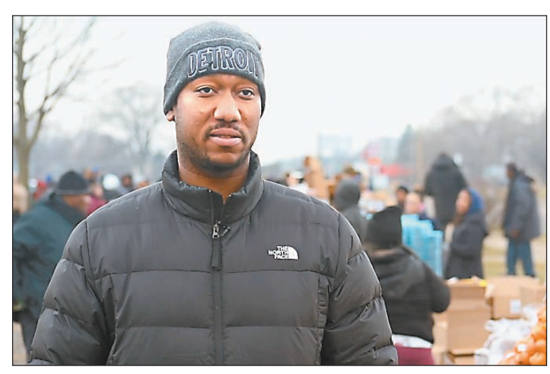
Skipper was one of many FCA employees who helped feed the hungry.

"Over a minimal period of two teaching discipline and positive coping skills, along with creating a fun after-school program with recreational outlets to reduce the amount of time allotted for destructive behavior and gang activities?