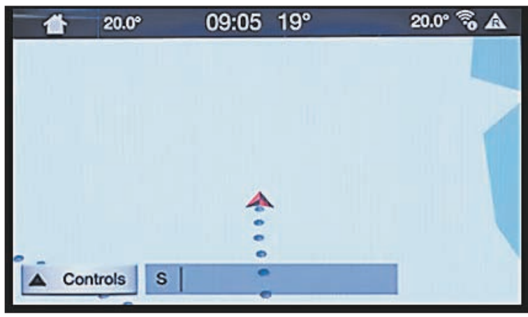
Ford technology tracks where you've been to create a path back.

When you're driving off the take you on your adventure on on the toughest terrain and take and Terrain Management System with Trail Control for situationspecific traction. Off-road accessories like a winch-capable front bumper and leveling kit are also available for improved ground clearance and rugged styling.