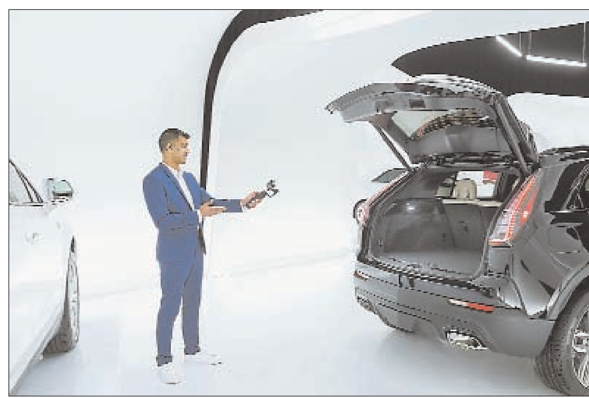
CONTINUED ON PAGE 4 Part personal shopper, part digital showroom, Cadillac Live lets buyers see Cadillac's lineup from anywhere.