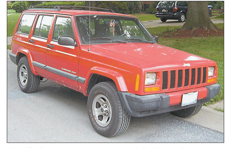
This 1997 Cherokee has landed on Hagerty's "Bull Market" car list.

1988-91 Honda CRX Si. Hagerty's take: "These filled every highschool parking lot in the 1990s, this car. Vipers have a reputation and millennials are now 60 percent of the quotes. As one of the first front-wheel-drive sporting Japanese cars to get widespread recognition from enthusiasts, they are symbolic of the golden Viper's favor, meaning there age of Honda, quick and go-kart-